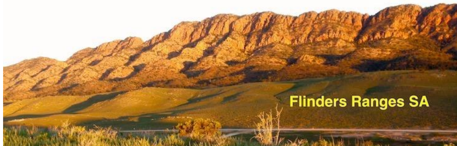
Flinders Ranges SA